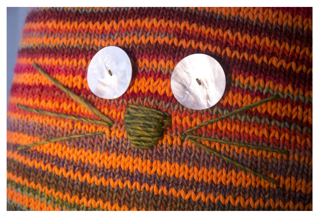
Enjoy your Cattercushion!

Again with the Rico yarn, using a bright length of it, sew a triangle nose and 3 whiskers each side, to look like this: