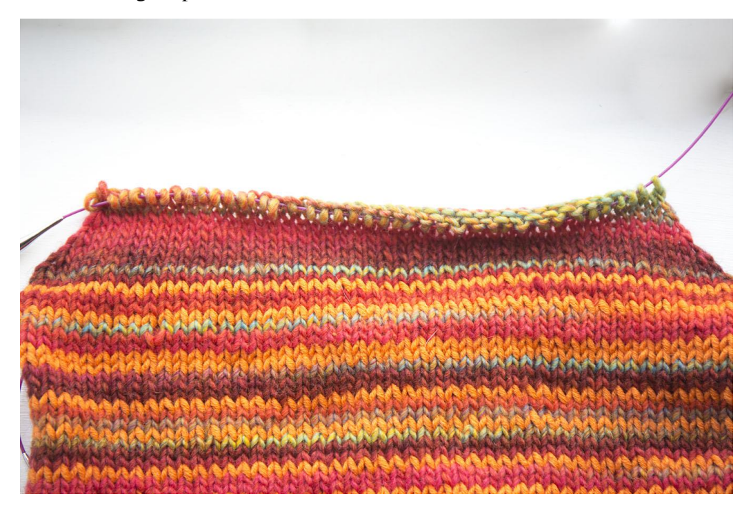
The ear taking shape as seen from the front: