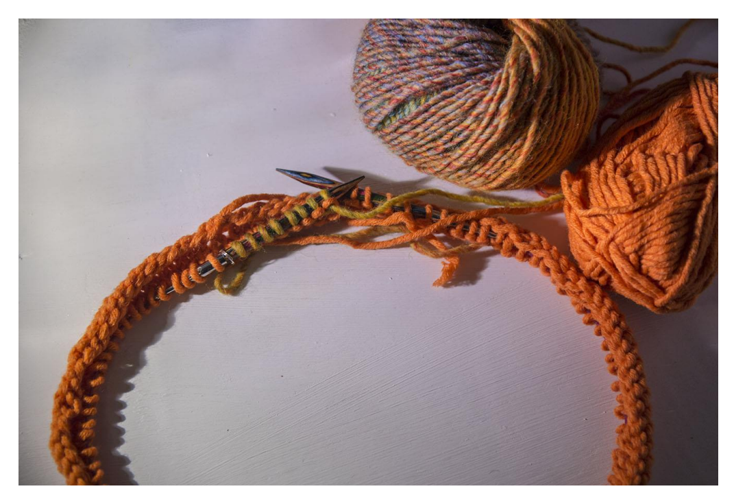
and Knit 2 rounds

Then knit random numbers of stripes for 42 cm – this is personal preference, really. I favoured a heavier volume of Rico, with one Rico ear and one Schachenmayr, but you may prefer a more uniform 2 rows each approach to the project. It's entirely up to you.